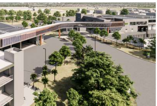
SOUTH DADE TRANSIT OPERATIONS CENTER

Highlight: LEED Gold cruise passenger terminal with a 809-car parking garage. The terminal accommodates ships of up to 5,000 passengers and features new technology to support faster and more efficient embarkation/disembarkation processes, as well as expedited security screening and luggage check-in. Role: CM at Risk.