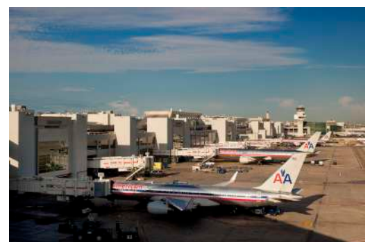
MIA NORTH TERMINAL DEVELOPMENT PROGRAM

Highlight: New electric bus maintenance & operations facility with 218,600 SF to maintain, energize, and operate a new fleet of 100 articulated (60-ft) battery-electric-buses (BEB). Role: CM at Risk.